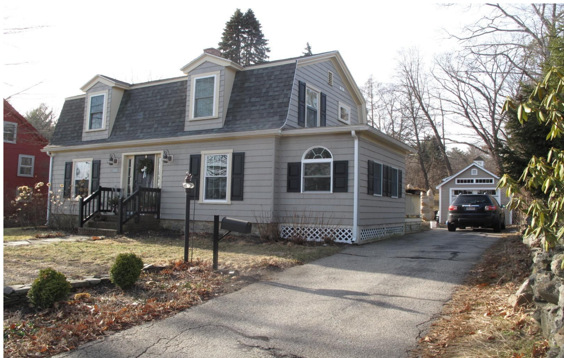
View from NE.

220 MORRISSEY BOULEVARD, BOSTON, MASSACHUSETTS 02125