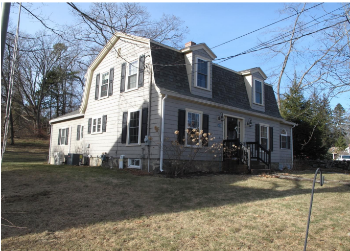
View from SE.