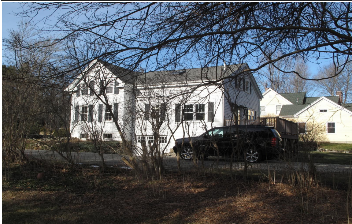
View from SE.

220 MORRISSEY BOULEVARD, BOSTON, MASSACHUSETTS 02125