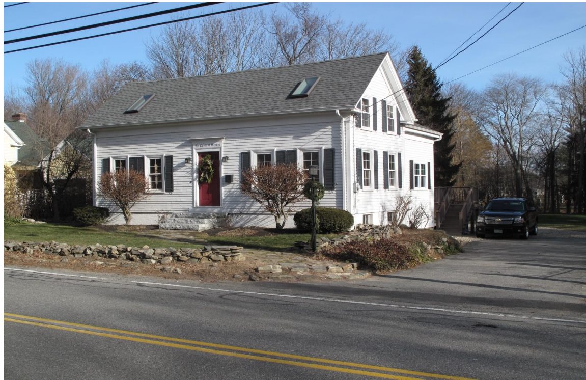
View from SW.

220 MORRISSEY BOULEVARD, BOSTON, MASSACHUSETTS 02125