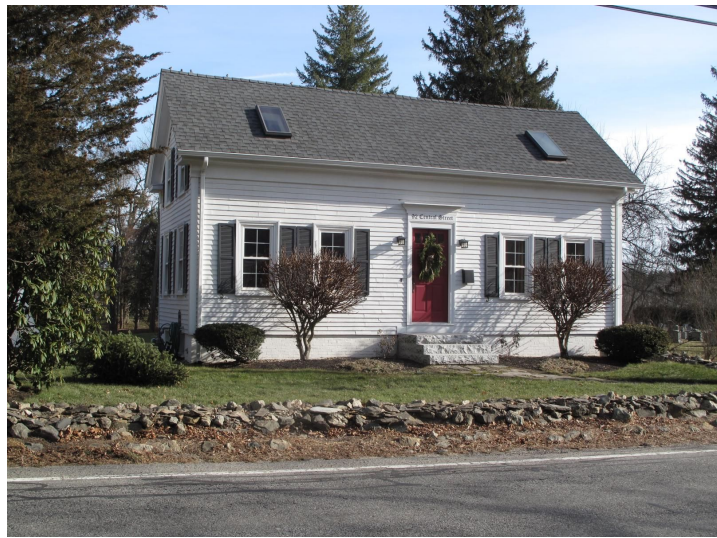
View from NW.

MASSACHUSETTS HISTORICAL COMMISSION MASSACHUSETTS ARCHIVES BUILDING 220 MORRISSEY BOULEVARD BOSTON, MASSACHUSETTS 02125