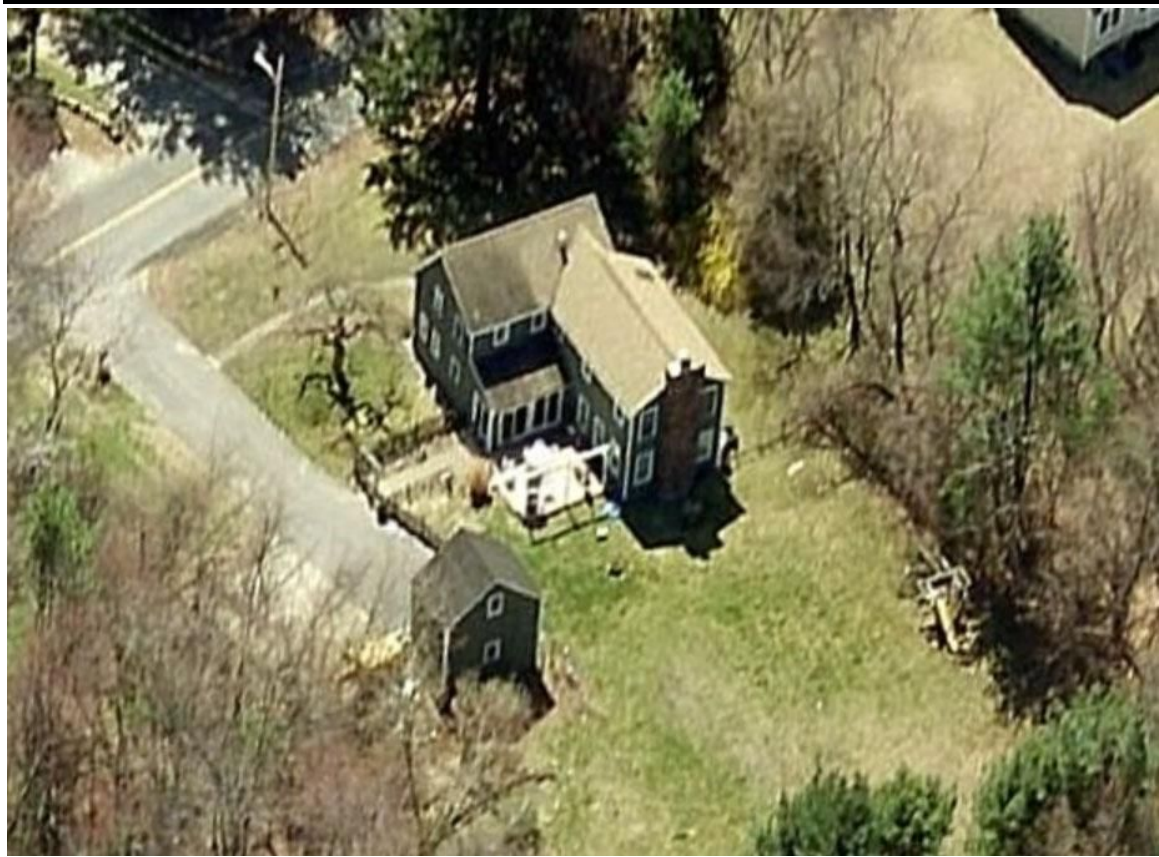
Aerial view from north.

220 MORRISSEY BOULEVARD, BOSTON, MASSACHUSETTS 02125