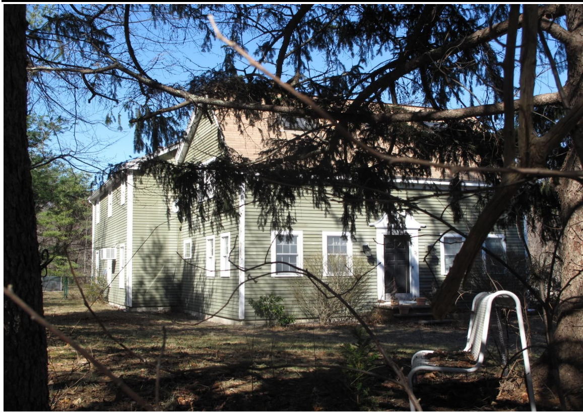
View from SE.

220 MORRISSEY BOULEVARD, BOSTON, MASSACHUSETTS 02125