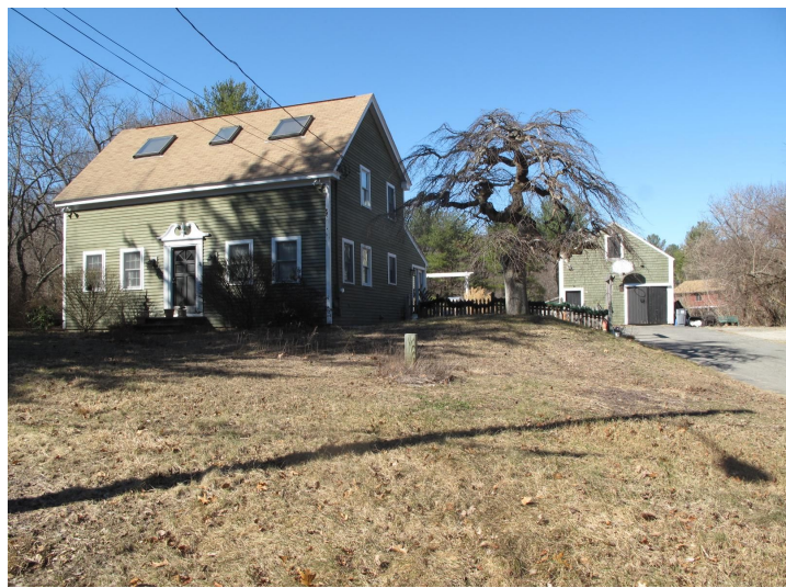
View from east.

MASSACHUSETTS HISTORICAL COMMISSION MASSACHUSETTS ARCHIVES BUILDING 220 MORRISSEY BOULEVARD BOSTON, MASSACHUSETTS 02125