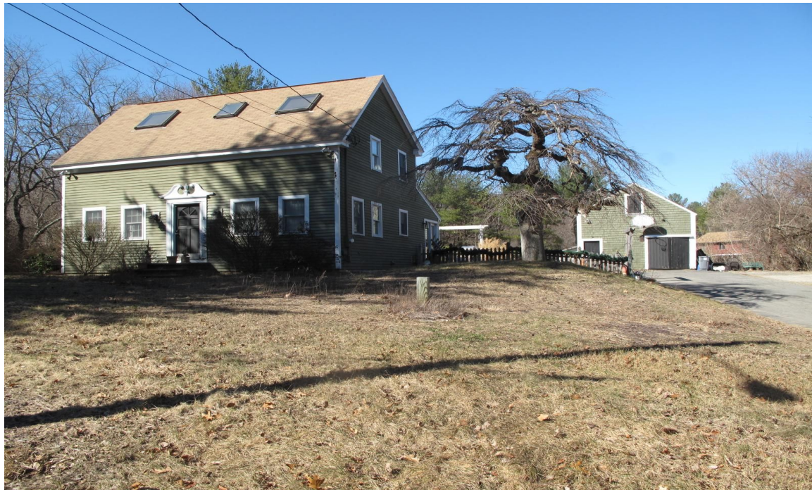
View from NE.

220 MORRISSEY BOULEVARD, BOSTON, MASSACHUSETTS 02125