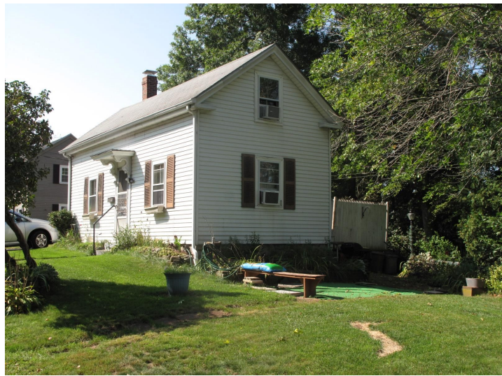
View from north.

MASSACHUSETTS HISTORICAL COMMISSION MASSACHUSETTS ARCHIVES BUILDING 220 MORRISSEY BOULEVARD BOSTON, MASSACHUSETTS 02125