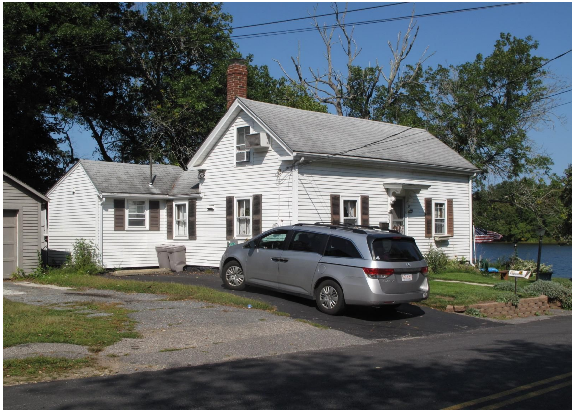
View from SE.

220 MORRISSEY BOULEVARD, BOSTON, MASSACHUSETTS 02125