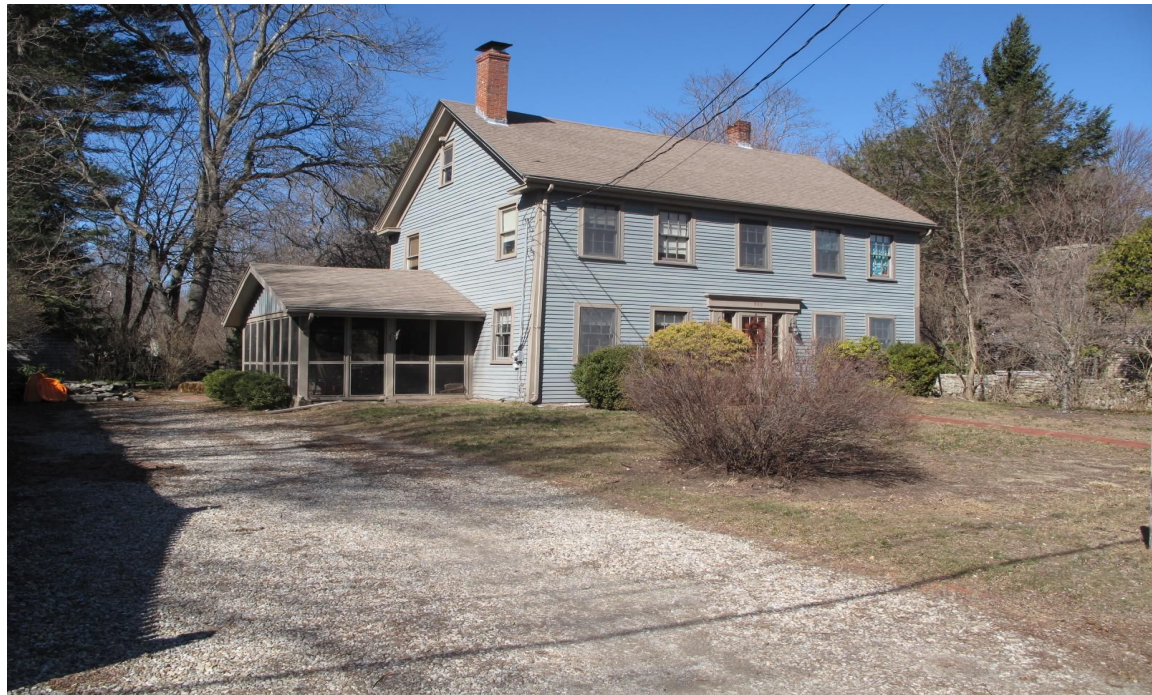
View from SE.

220 MORRISSEY BOULEVARD, BOSTON, MASSACHUSETTS 02125