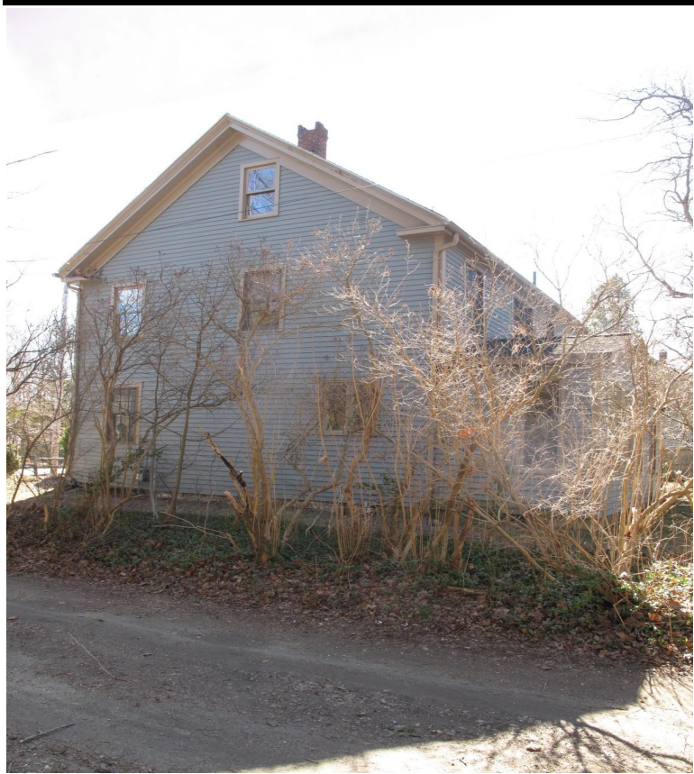
View from NW.

220 MORRISSEY BOULEVARD, BOSTON, MASSACHUSETTS 02125