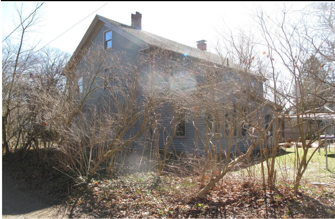
View from NW.

220 MORRISSEY BOULEVARD, BOSTON, MASSACHUSETTS 02125