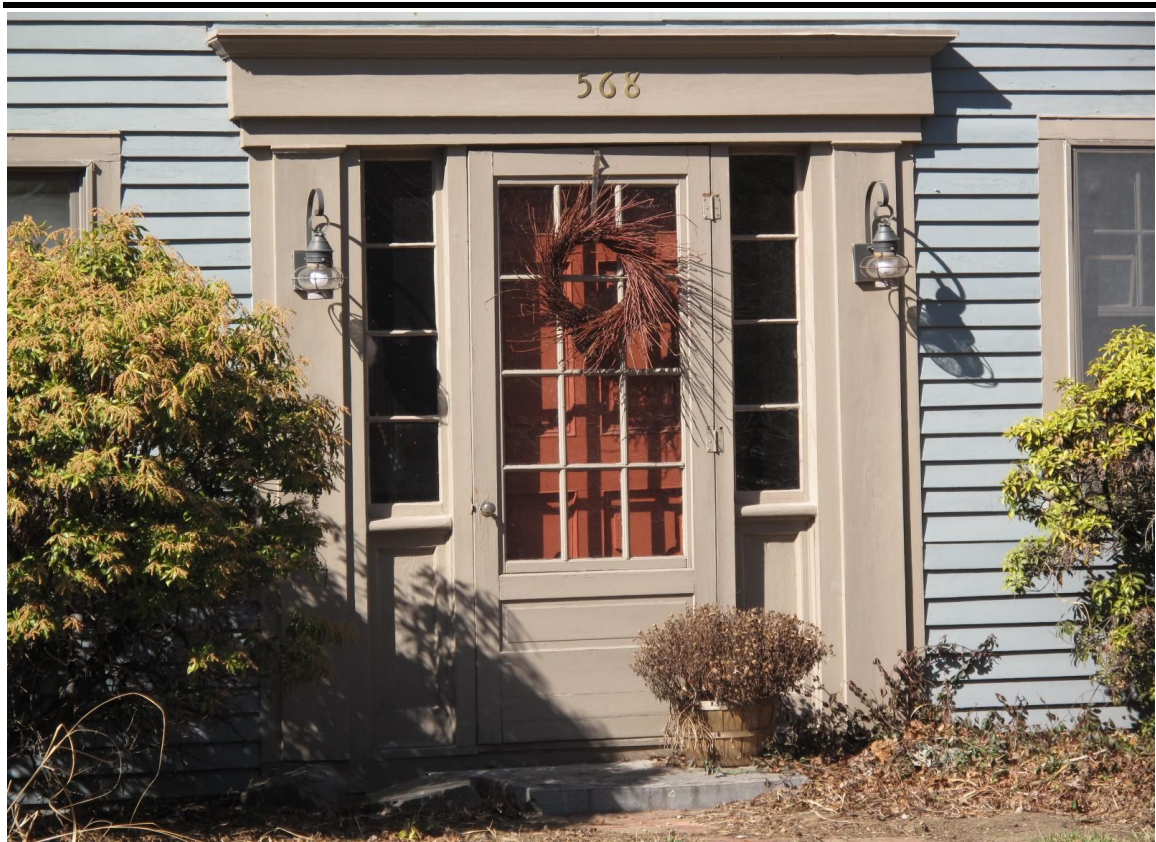
Detail of center entrance.

220 MORRISSEY BOULEVARD, BOSTON, MASSACHUSETTS 02125