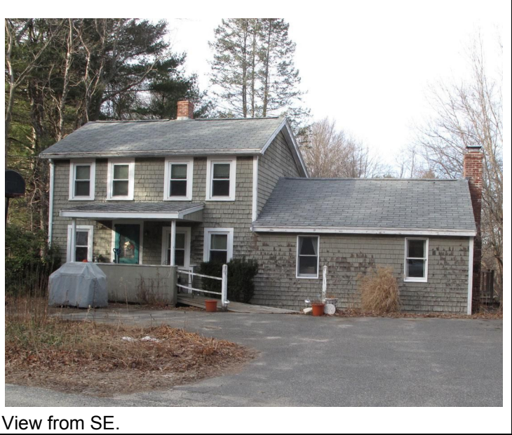
View from SE.

MASSACHUSETTS HISTORICAL COMMISSION MASSACHUSETTS ARCHIVES BUILDING 220 MORRISSEY BOULEVARD BOSTON, MASSACHUSETTS 02125