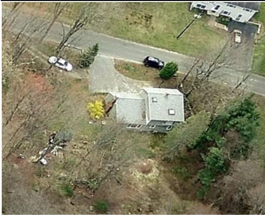
Aerial view from north.

220 MORRISSEY BOULEVARD, BOSTON, MASSACHUSETTS 02125