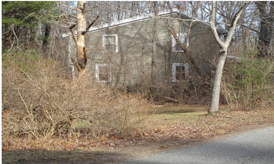
View from west.

220 MORRISSEY BOULEVARD, BOSTON, MASSACHUSETTS 02125