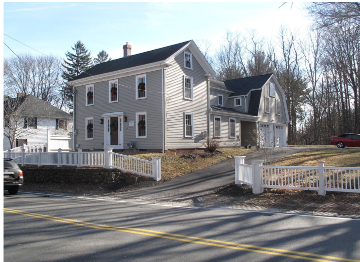
View from NW.

MASSACHUSETTS HISTORICAL COMMISSION MASSACHUSETTS ARCHIVES BUILDING 220 MORRISSEY BOULEVARD BOSTON, MASSACHUSETTS 02125