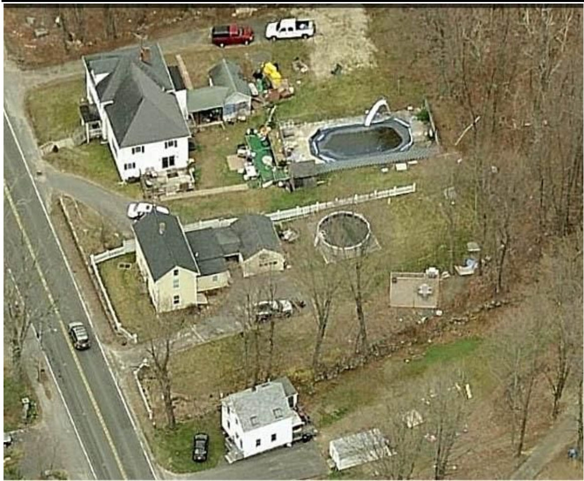
Aerial view from west showing earlier rear wing and attached garage.

220 MORRISSEY BOULEVARD, BOSTON, MASSACHUSETTS 02125