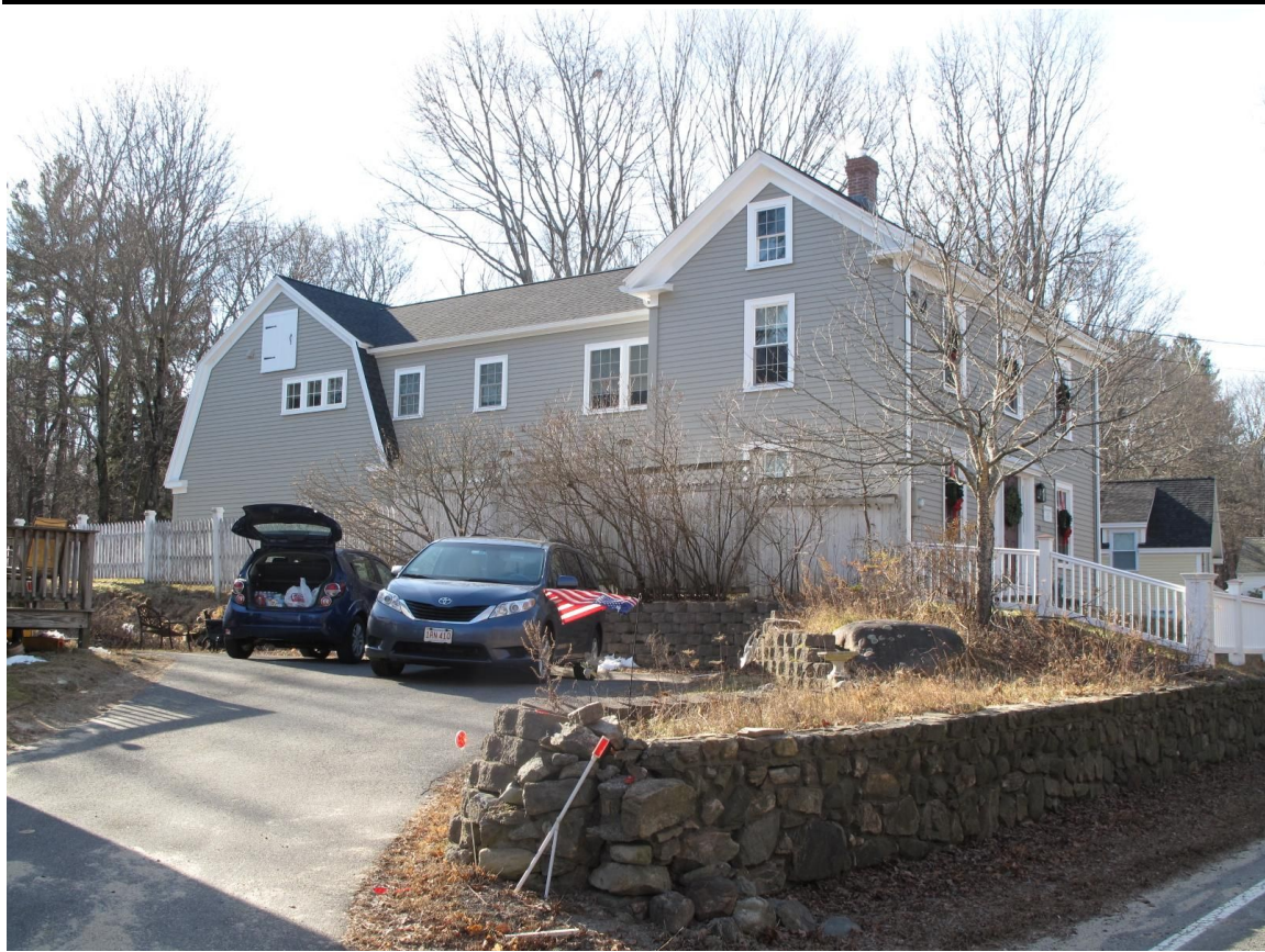
View from NE.

220 MORRISSEY BOULEVARD, BOSTON, MASSACHUSETTS 02125