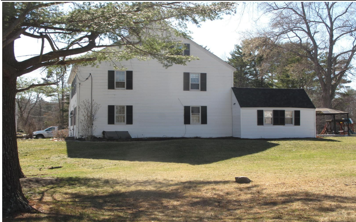
View from north.

220 MORRISSEY BOULEVARD, BOSTON, MASSACHUSETTS 02125