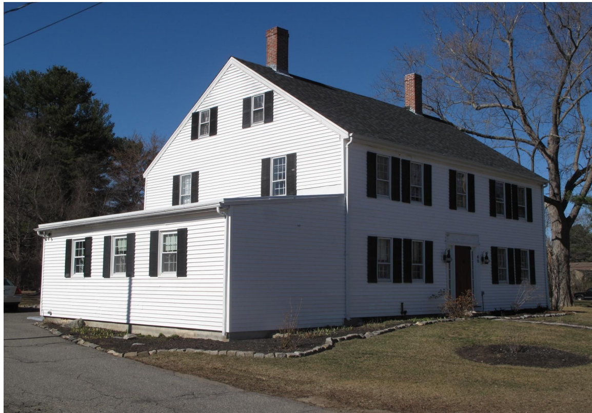
View from SE.

220 MORRISSEY BOULEVARD, BOSTON, MASSACHUSETTS 02125