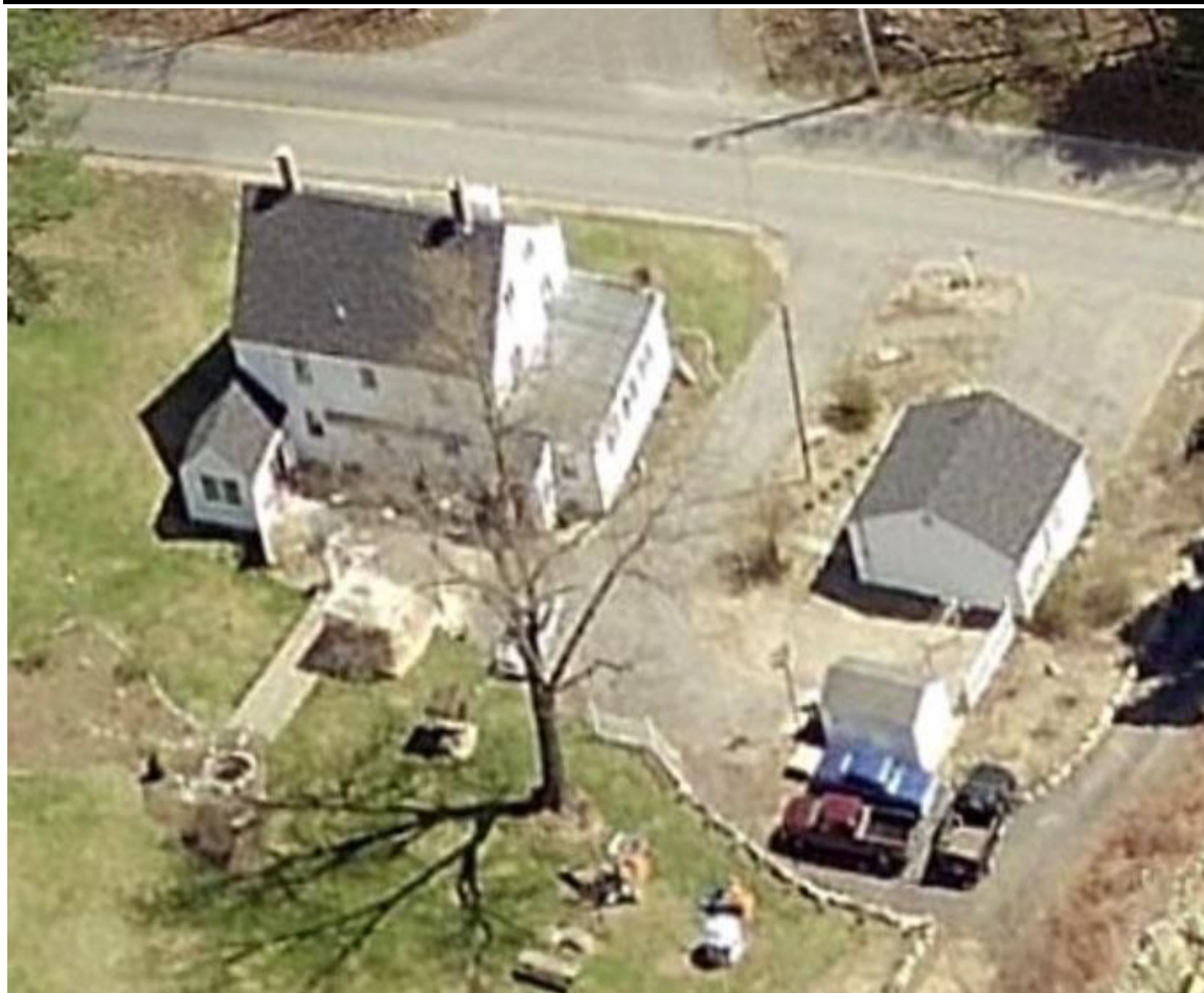
Aerial view form west.

220 MORRISSEY BOULEVARD, BOSTON, MASSACHUSETTS 02125