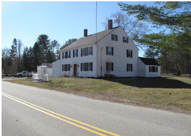
View from NE.

MASSACHUSETTS HISTORICAL COMMISSION MASSACHUSETTS ARCHIVES BUILDING 220 MORRISSEY BOULEVARD BOSTON, MASSACHUSETTS 02125