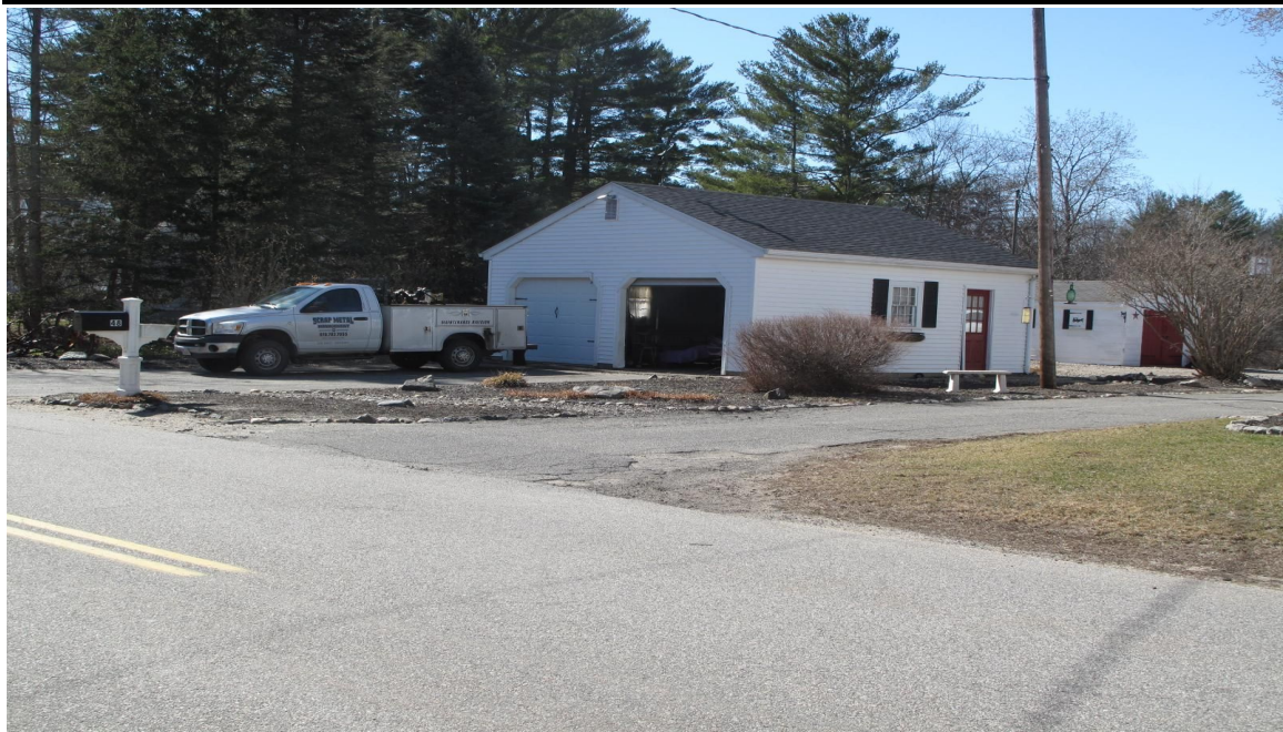
View of garages from NE.

220 MORRISSEY BOULEVARD, BOSTON, MASSACHUSETTS 02125