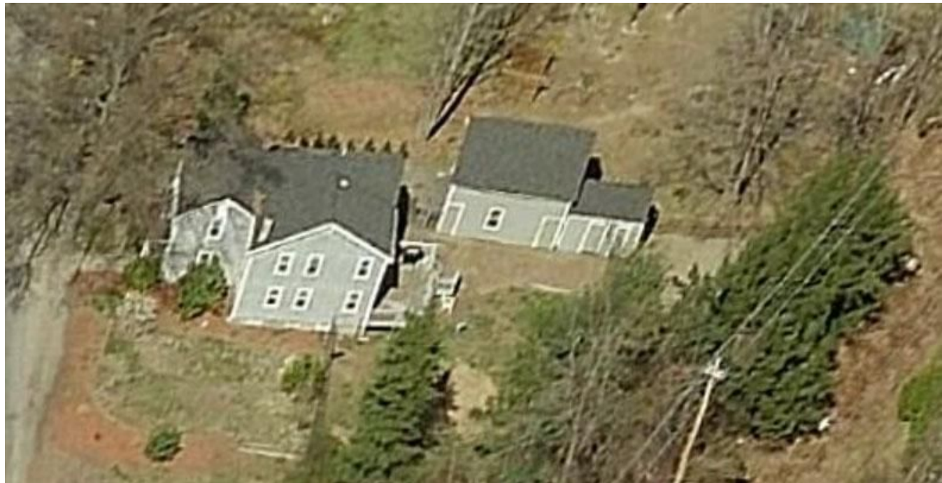
Aerial view form south.