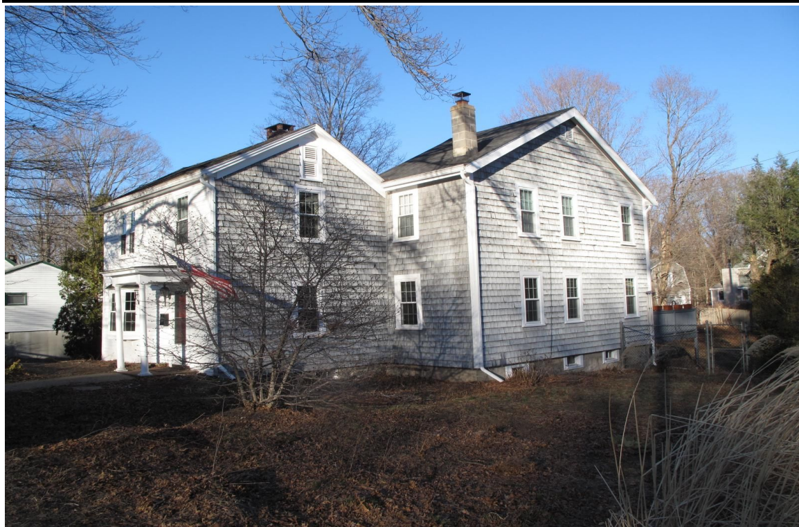
View from SE.

220 MORRISSEY BOULEVARD, BOSTON, MASSACHUSETTS 02125