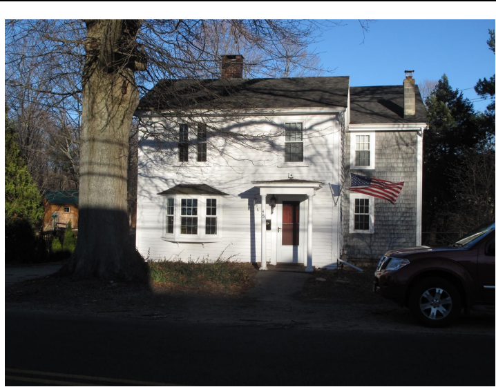
View from west.

MASSACHUSETTS HISTORICAL COMMISSION MASSACHUSETTS ARCHIVES BUILDING 220 MORRISSEY BOULEVARD BOSTON, MASSACHUSETTS 02125