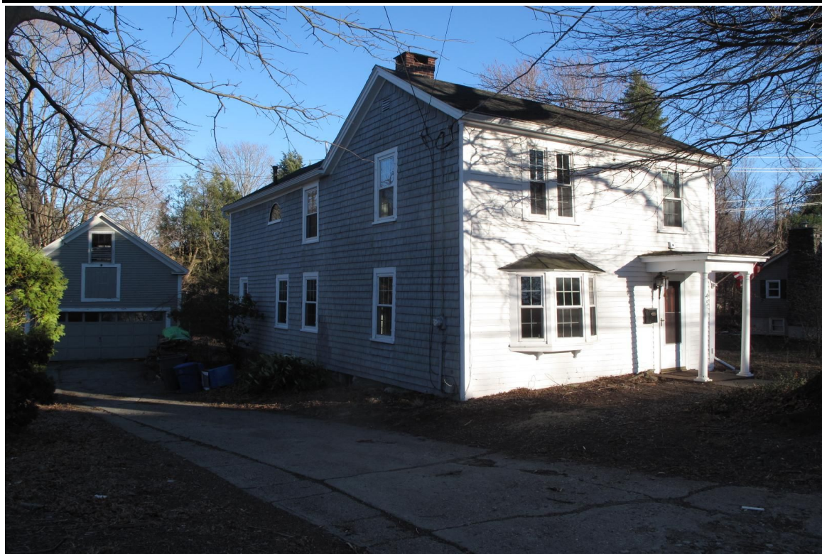
View from NE.

220 MORRISSEY BOULEVARD, BOSTON, MASSACHUSETTS 02125