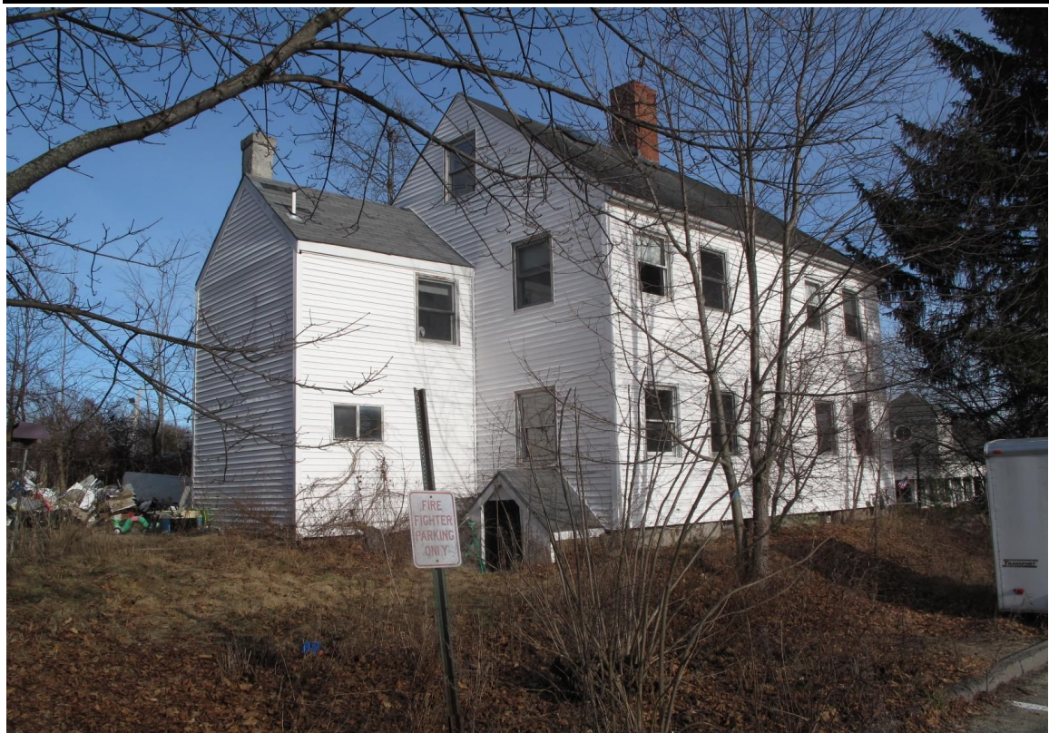
View from SW.

220 MORRISSEY BOULEVARD, BOSTON, MASSACHUSETTS 02125