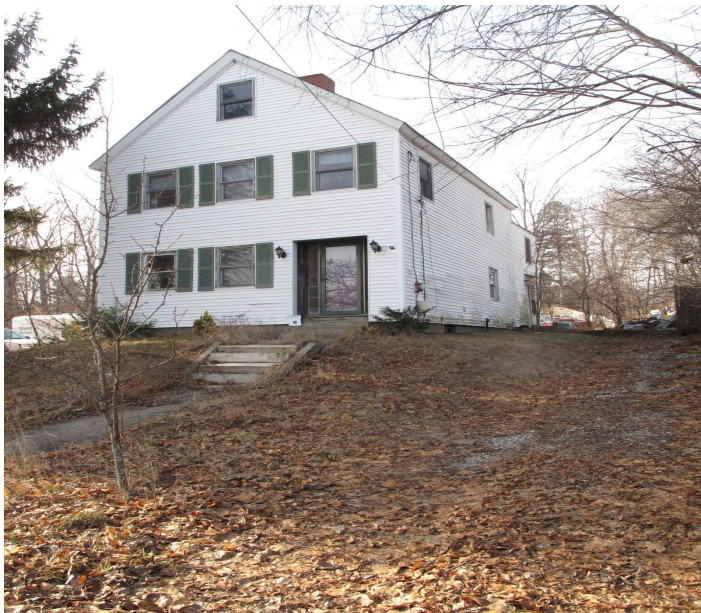
View from east.