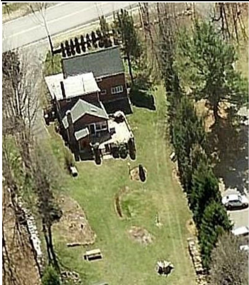
Aerial view from north.

220 MORRISSEY BOULEVARD, BOSTON, MASSACHUSETTS 02125