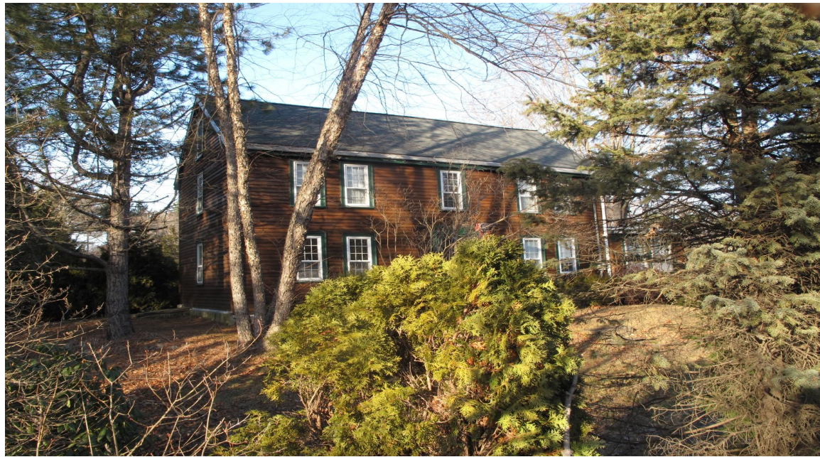
View from SW.

220 MORRISSEY BOULEVARD, BOSTON, MASSACHUSETTS 02125