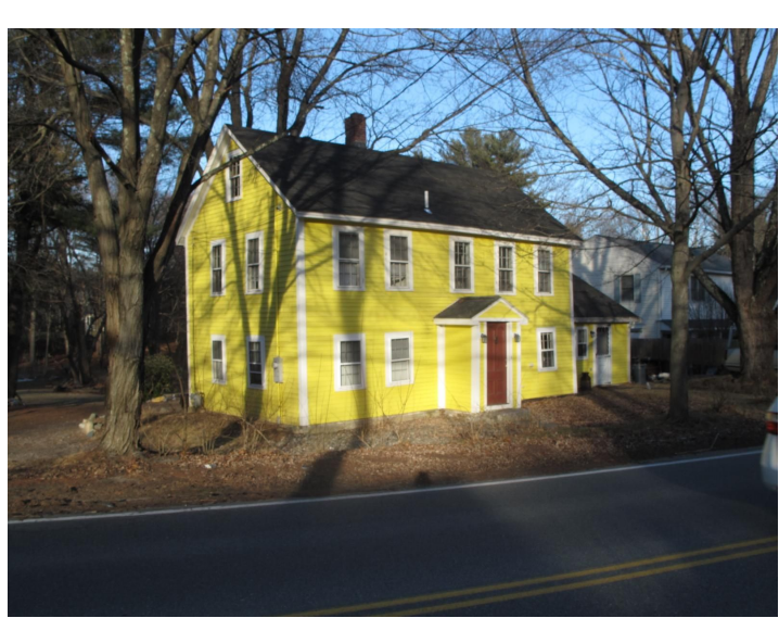
View from SW.

MASSACHUSETTS HISTORICAL COMMISSION MASSACHUSETTS ARCHIVES BUILDING 220 MORRISSEY BOULEVARD BOSTON, MASSACHUSETTS 02125