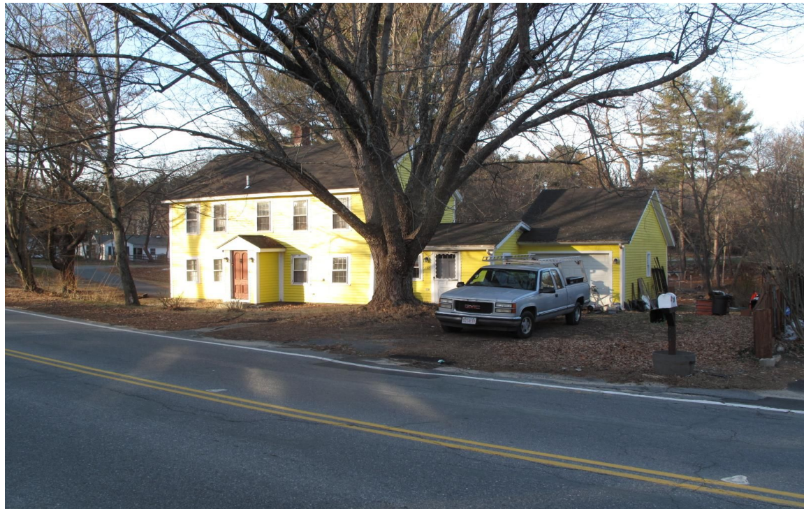
View from SE.

220 MORRISSEY BOULEVARD, BOSTON, MASSACHUSETTS 02125