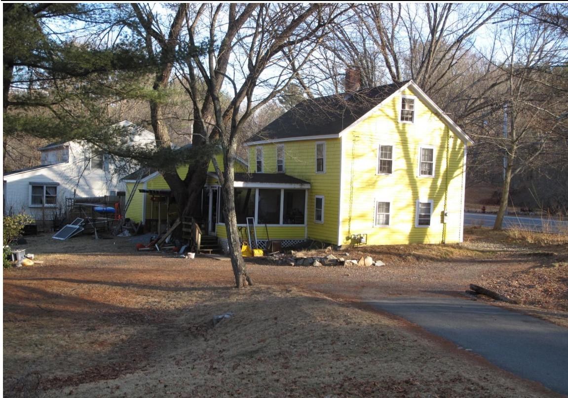
View from NW.

220 MORRISSEY BOULEVARD, BOSTON, MASSACHUSETTS 02125