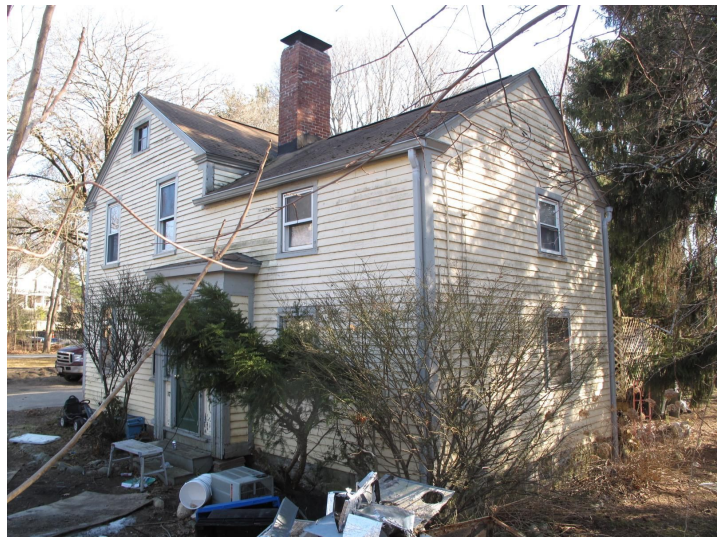
View from NW.

MASSACHUSETTS HISTORICAL COMMISSION MASSACHUSETTS ARCHIVES BUILDING 220 MORRISSEY BOULEVARD BOSTON, MASSACHUSETTS 02125