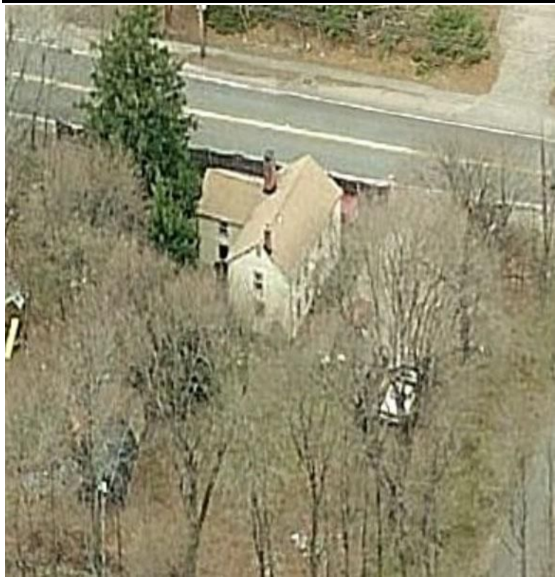
Aerial view from south.

220 MORRISSEY BOULEVARD, BOSTON, MASSACHUSETTS 02125