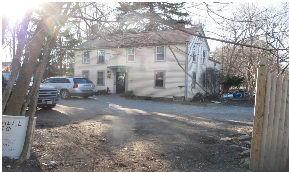
View from NE.

220 MORRISSEY BOULEVARD, BOSTON, MASSACHUSETTS 02125