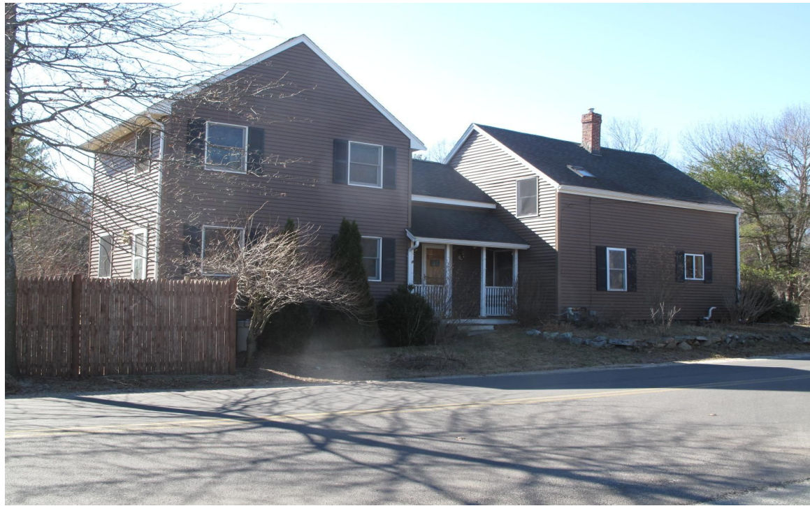
View from SE.

220 MORRISSEY BOULEVARD, BOSTON, MASSACHUSETTS 02125