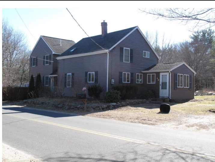
View from north.

MASSACHUSETTS HISTORICAL COMMISSION MASSACHUSETTS ARCHIVES BUILDING 220 MORRISSEY BOULEVARD BOSTON, MASSACHUSETTS 02125