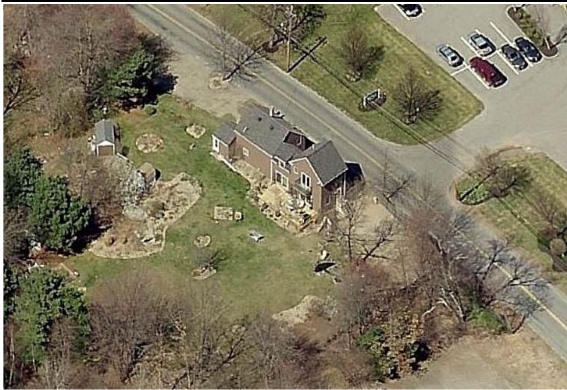
View from south.

220 MORRISSEY BOULEVARD, BOSTON, MASSACHUSETTS 02125