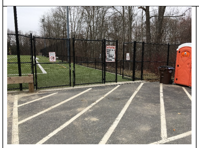
Paved access to field, ADA compliant.