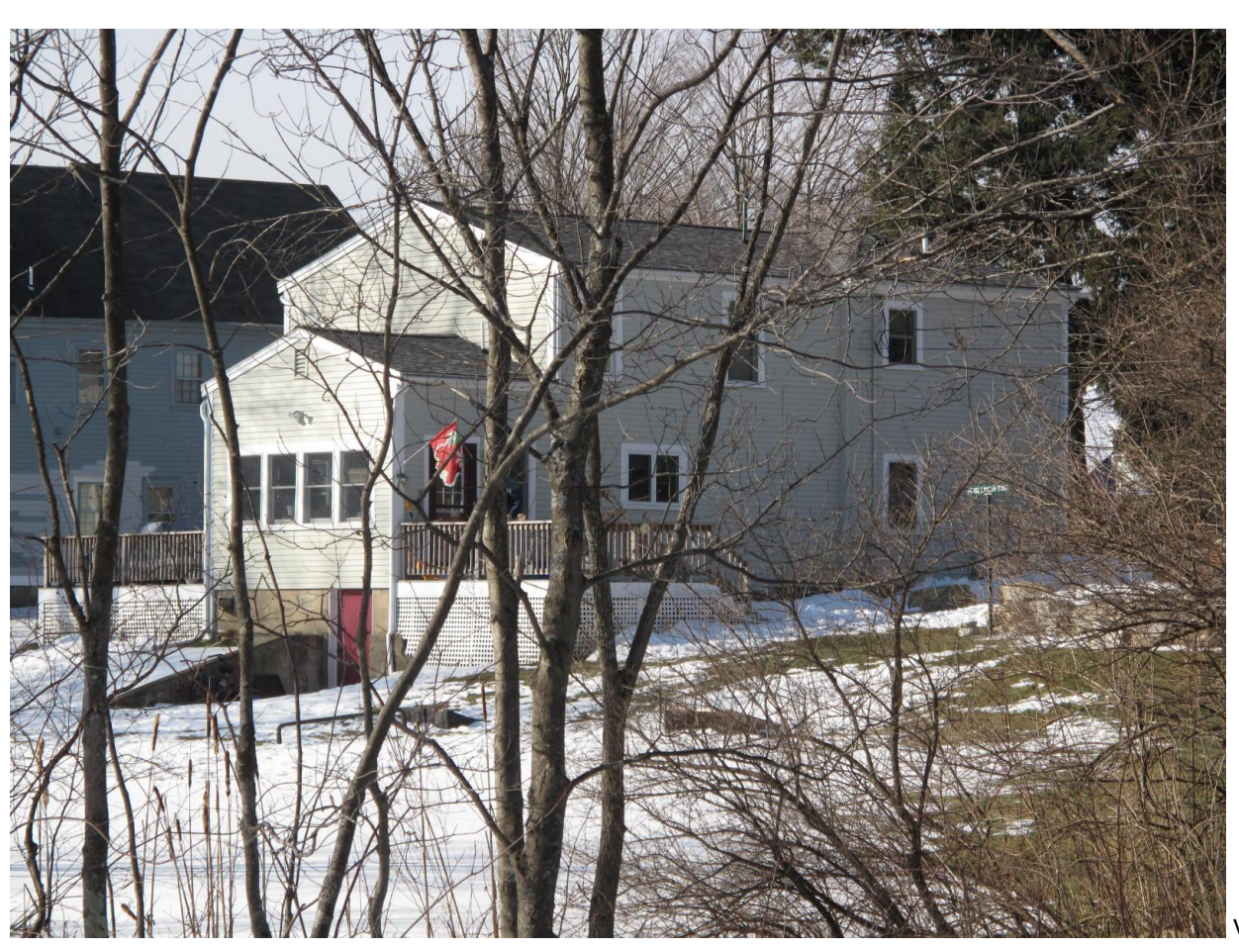
View from NE