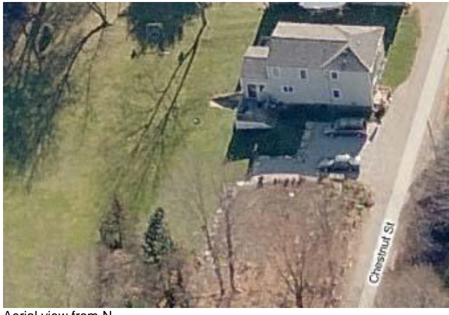
Aerial view from N