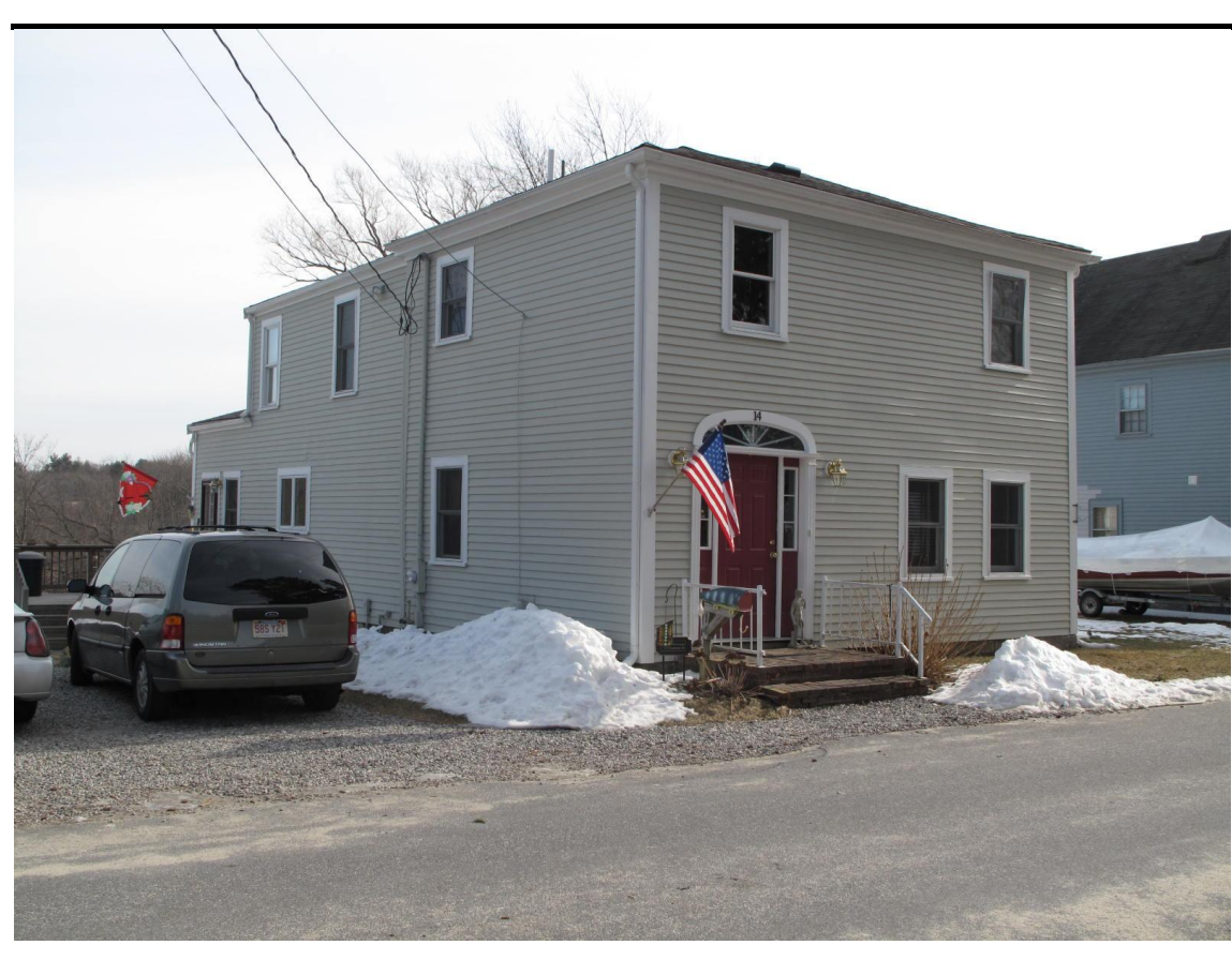
View from NW