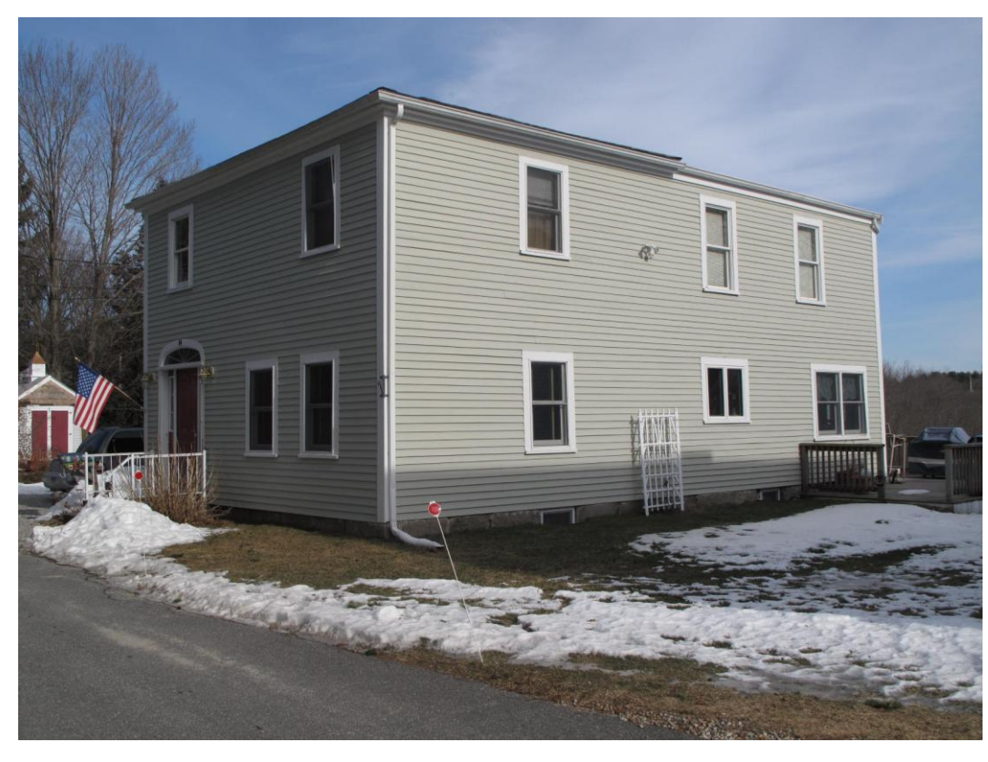
View from SW